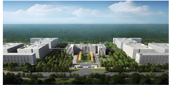
Agricultural Bank of China Inner Mongolia Data Center