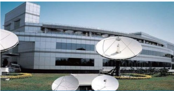
Shanghai Securities Waigaoqiao Earth Station