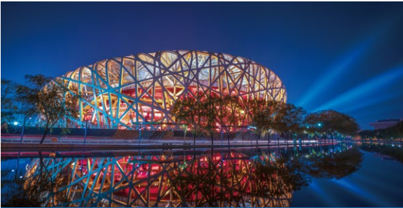
Beijing Olympic Games