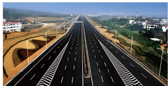
Ruili to Menglian Expressway Electromechanical Project