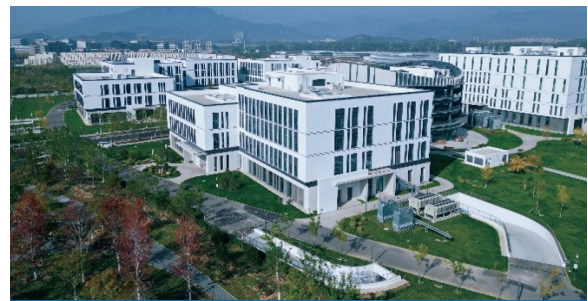
Peking University Biomedical Imaging Technology Cluster Large Facility